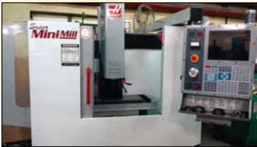
MINI MILL machining centre

It already is the third machining centre by this renowned manufacturer which is used at the Production Preparation Department. The new machine increases our capabilities for the preparation of models and core boxes for newly started castings. This is particularly important regarding the fact that the number of products launched on a monthly basis is getting higher. Besides, the tooling and instrumentation made by external companies is expensive and gives rise to various problems.